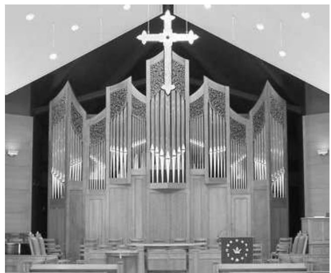
Lively-Fulcher organ at Christ Church, Exeter, New Hampshire