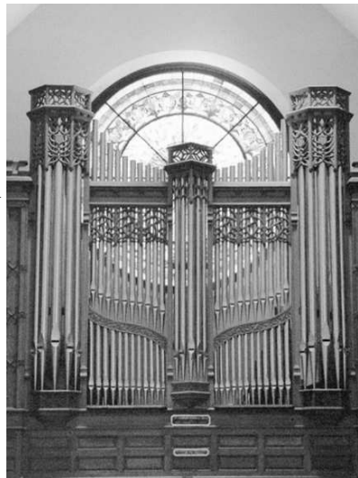
Organ Facade at First Church, Nashua, NH