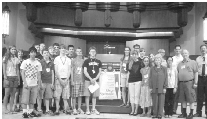
The whole POEA camp, students and faculty, Summer, 2008 in Lincoln, Nebraska