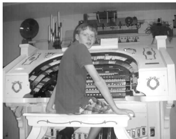
A POEA student at the theatre organ console